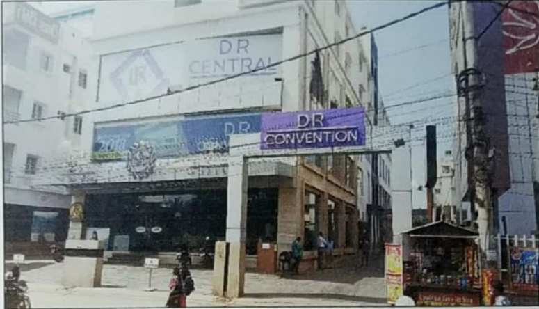
PHOTO GRAPHY OF THE PROPERTY